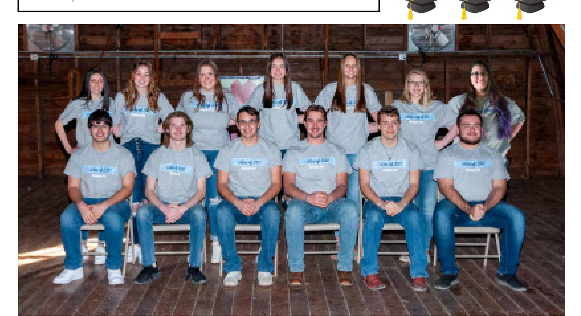
Congratulations, Class of 2021!